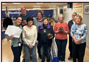
Duckpin bowling fun!